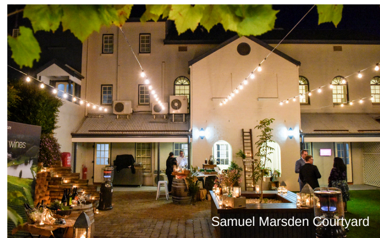
Samuel Marsden Courtyard

Fall in love with our selection of vibrant, relaxing and picture perfect outdoor spaces. Designed for events, we'll help you plan a stunning celebration both you and your guests will love.